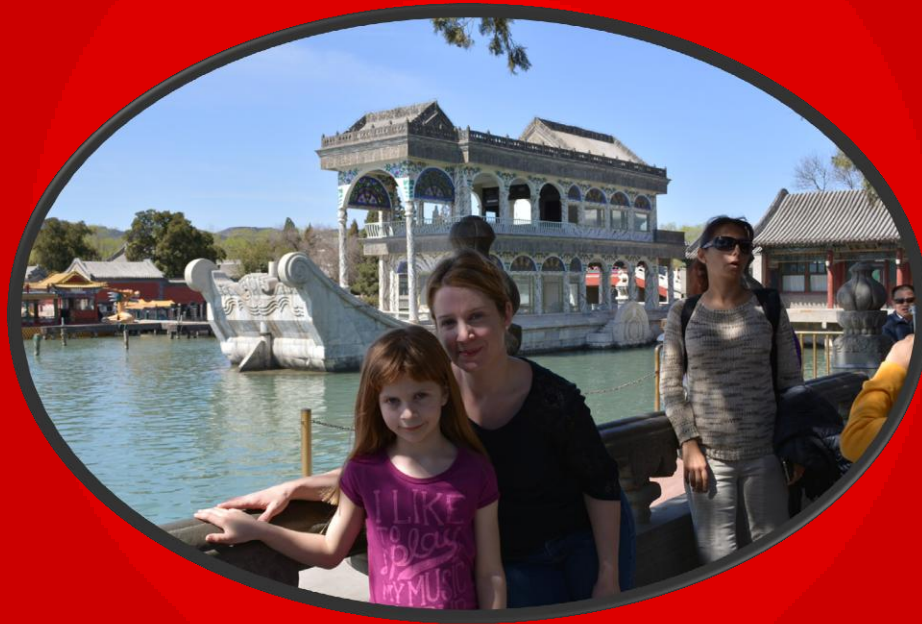
The Summer Palace in Beijing