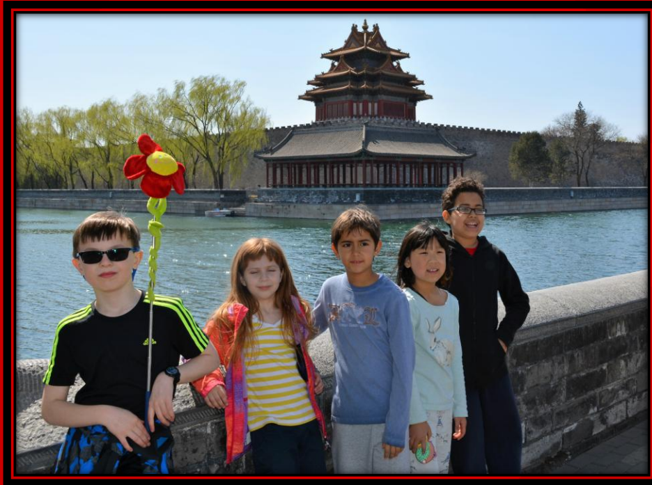
Tiananmen Square and the Forbidden City