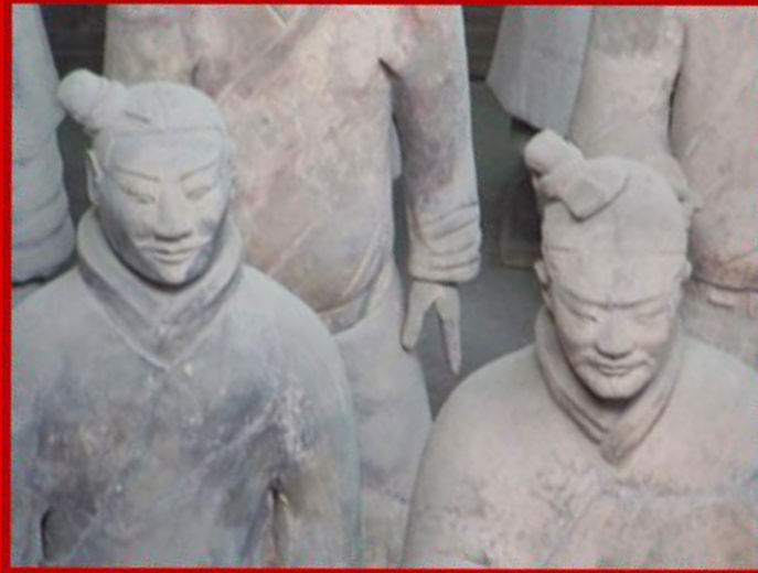
The Terra Cotta Warriors in Xi'an