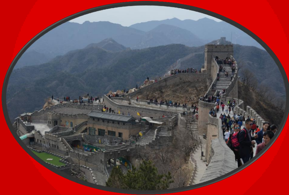
The Great Wall near Beijing